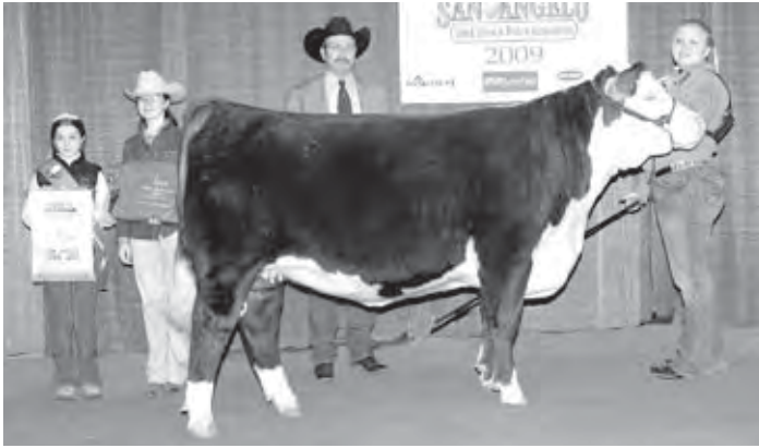
F&F JDM ALLISON 727 ET Calved 03/24/07 • 42844774 • Tattoo: 727