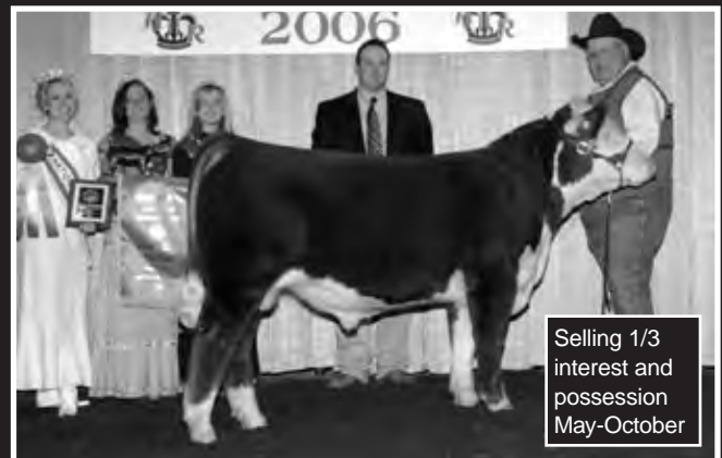
GKB UPTOWN B613 ET • DOB 1-27-06 • P42722204

CE -2.2 (.20) • BW 3.4 (.64) • WW 56 (.54) • YW 97 (.55) • MM 18 (.17) M&G 46 • MCE -0.3 (.15) • SC 1.1 (.38) • FAT 0.01 (.44) • REA 0.18 (.43) IMF -0.01 (.41) • BMI $17 • CEZ $12 • BII $15 • CHB $24