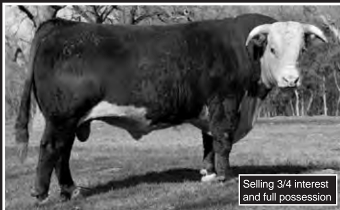
C HIDALGO ET • DOB 1-1-04 • 42473399