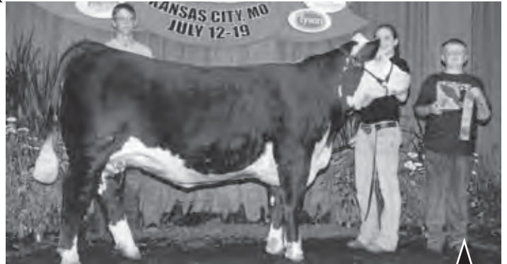
Dam: F&F MISS CHANNING 6172 ET

PACKAGE OF 4 FROZEN EMBRYOS Sire: H TOP HAT 604 • Dam: F&F MISS CHANNING 6172 ET