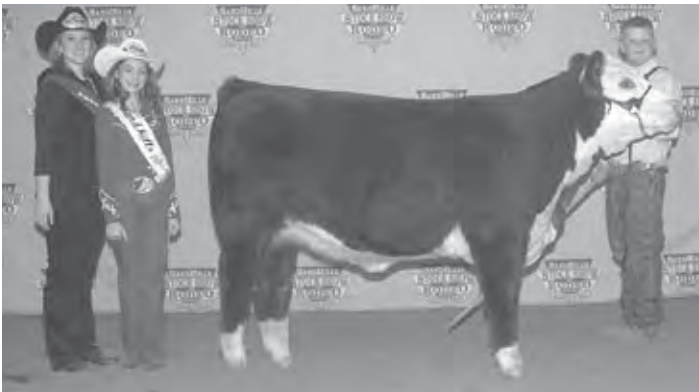
F&F JDM PAGE 7160 ET Calved 11/08/07 • 42898949 • Tattoo: 7160