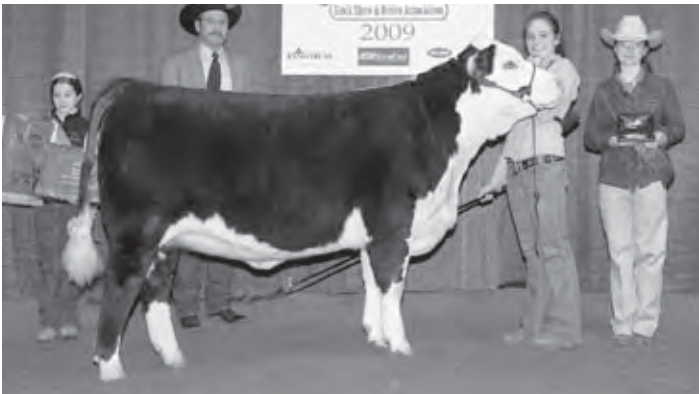
F&F JDM PRU 7162 ET Calved 11/10/07 • 42898951 • Tattoo: 7162

BW +4.2 / WW +51 / YW +89 / MM +41 / M&G +39 Consigned by FUSTON, TURKEY and MEHAFFEY, BURLESON